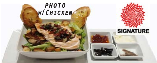
PHOTO w/ CHICKEN